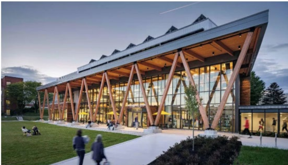
The large scale of the McGoldrick Center for Career & Student Success begins with its soaring south-facing portico. Diagonal cross-laminated timber columns create a signature visual expression across the front façade.