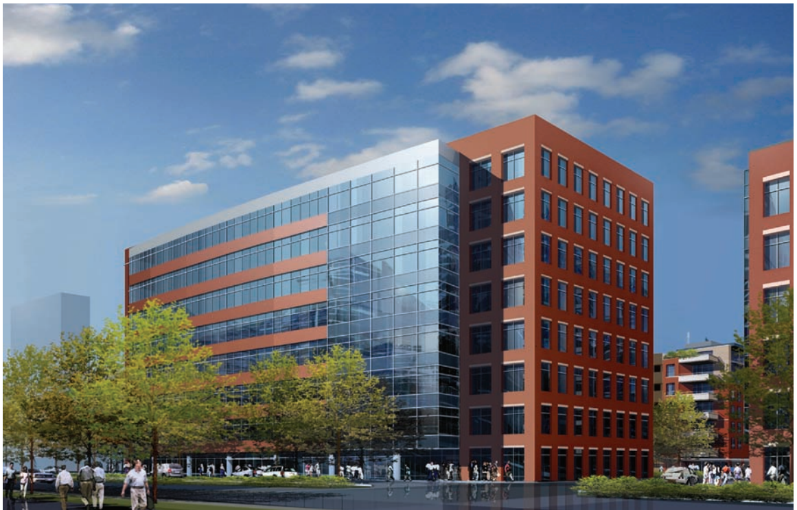
US Oncology Headquarters (Building D)